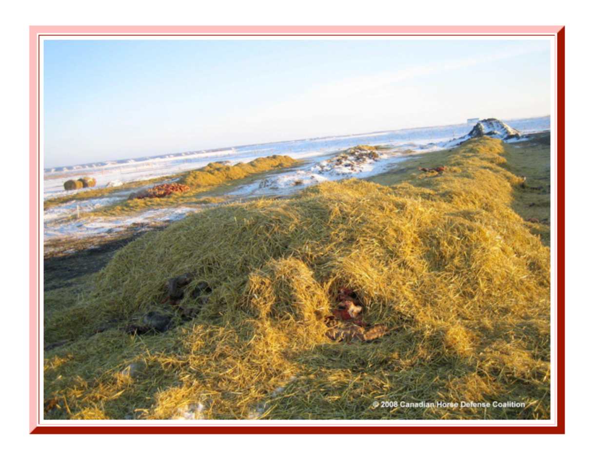
Row upon row of internal organs from horses slaughtered at Natural Valley Farms.