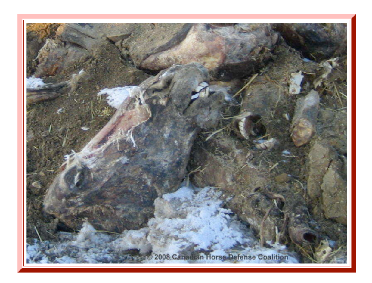
At least 3 horse heads discovered in Natural Valley Farms' Rendering Pit on February 26, 2008.