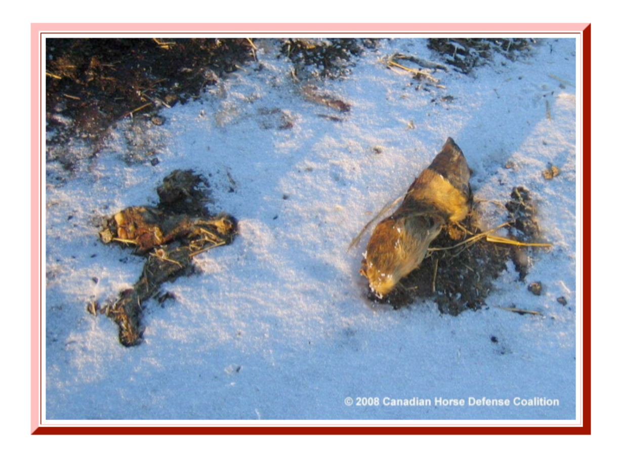
Cut-off leg from a young horse discovered in Natural Valley Farms' Rendering Pit on February 26, 2008.