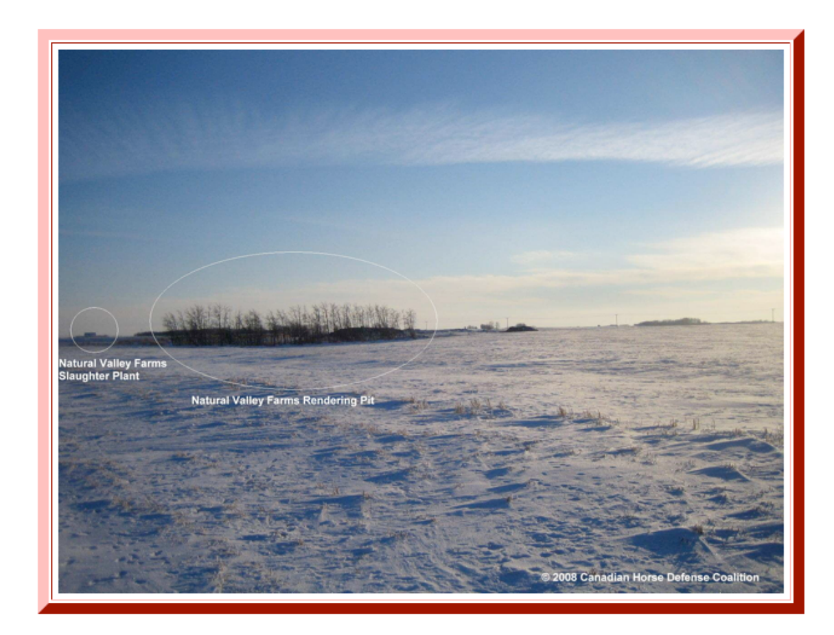
Photo showing the location of the Rendering Pit from Natural Valley Farms horse slaughter plant in Neudorf, Saskatchewan (plant in the background, Pit in the foreground).

Management at Natural Valley Farms has denied having such a Pit - this photo clearly establishes its presence and proximity to the slaughter plant.